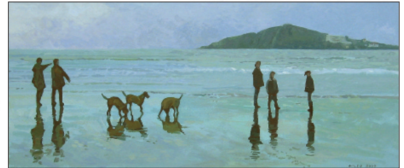
October Reflections – Bantham