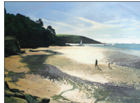
North Sands – Salcombe