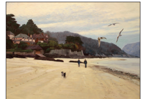
Winter's Ebb – Small's Cove