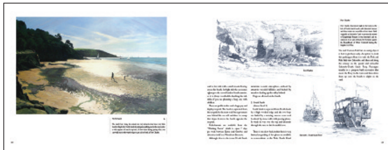
Example of a double page spread.